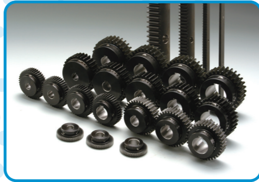
Example of Modification